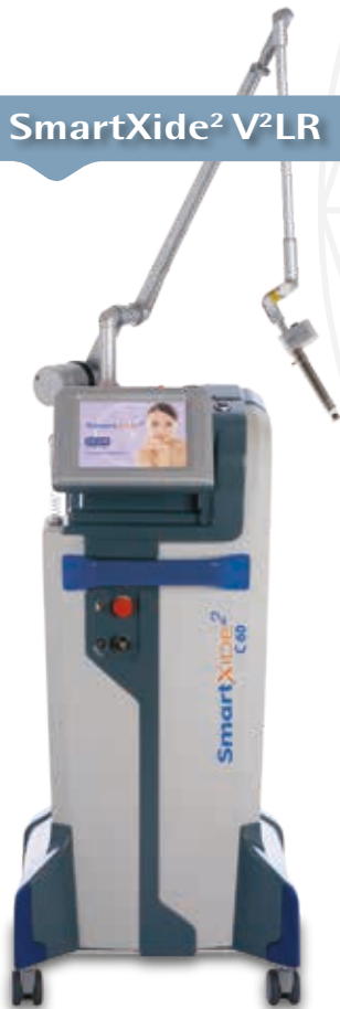
SmartXide 2 V 2 LR